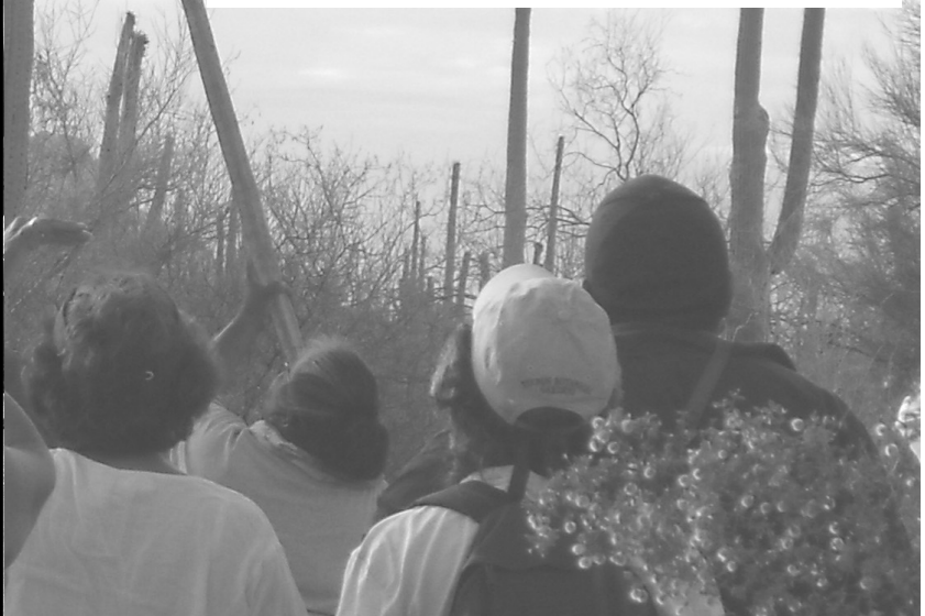
Stella Tucker demonstrates how to use the kuipad (AILDI 2009)