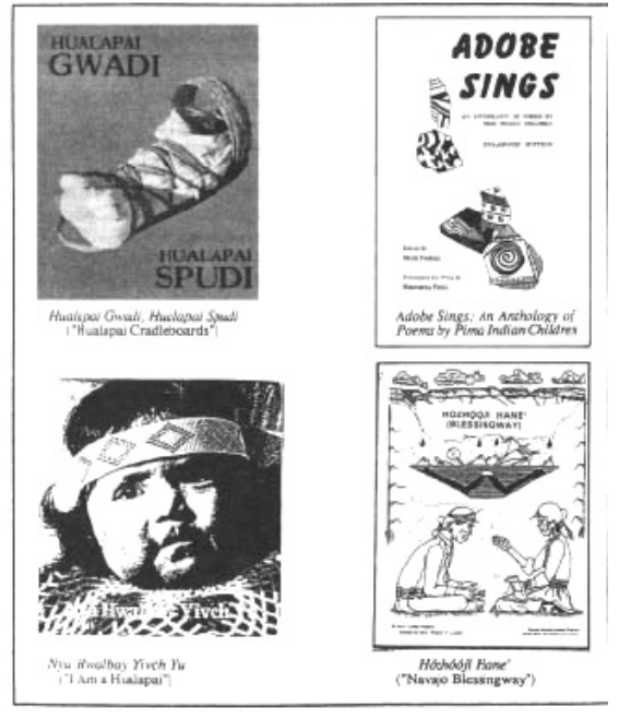
Figure 2. Examples of Curriculum Materials Developed by AILDI Participants

administrative and other leadership positions within their local schools.