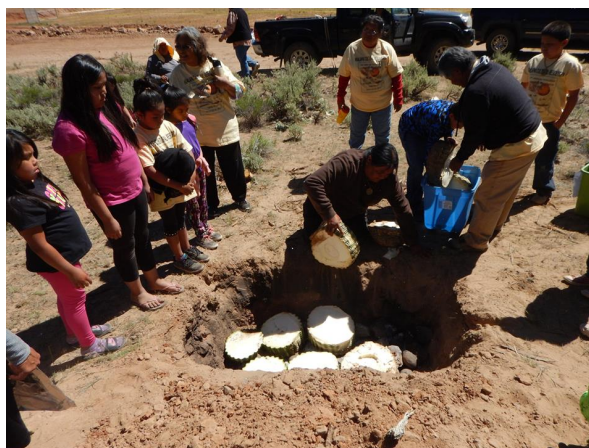
Hualapai students gather 'round to learn the process of preparing a mescal pit